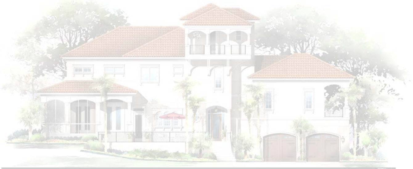
TRC RESIDENCE FRONT ELEVATION

This offer is not directed to residents in any state in which a registration of a timeshare plan is required but in which registration requirements have not been met. The seller cannot offer an interest in the fractional ownership plan for the sale until a registered public offering statement has been filed with the Division of Florida Land Sales, Condominiums and Mobile Homes. This advertisement is for information purposes only. Please refer to the governing documents for 280 Beach Drive for complete details. Prices, plans, dimensions, specifications, material and availability are subject to change without notice.